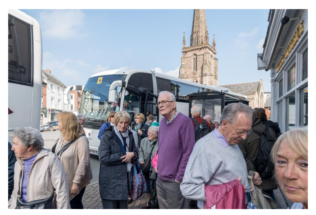
Arriving at Hereford