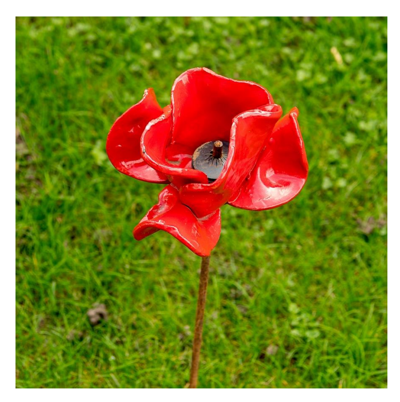
A Single Life remembered