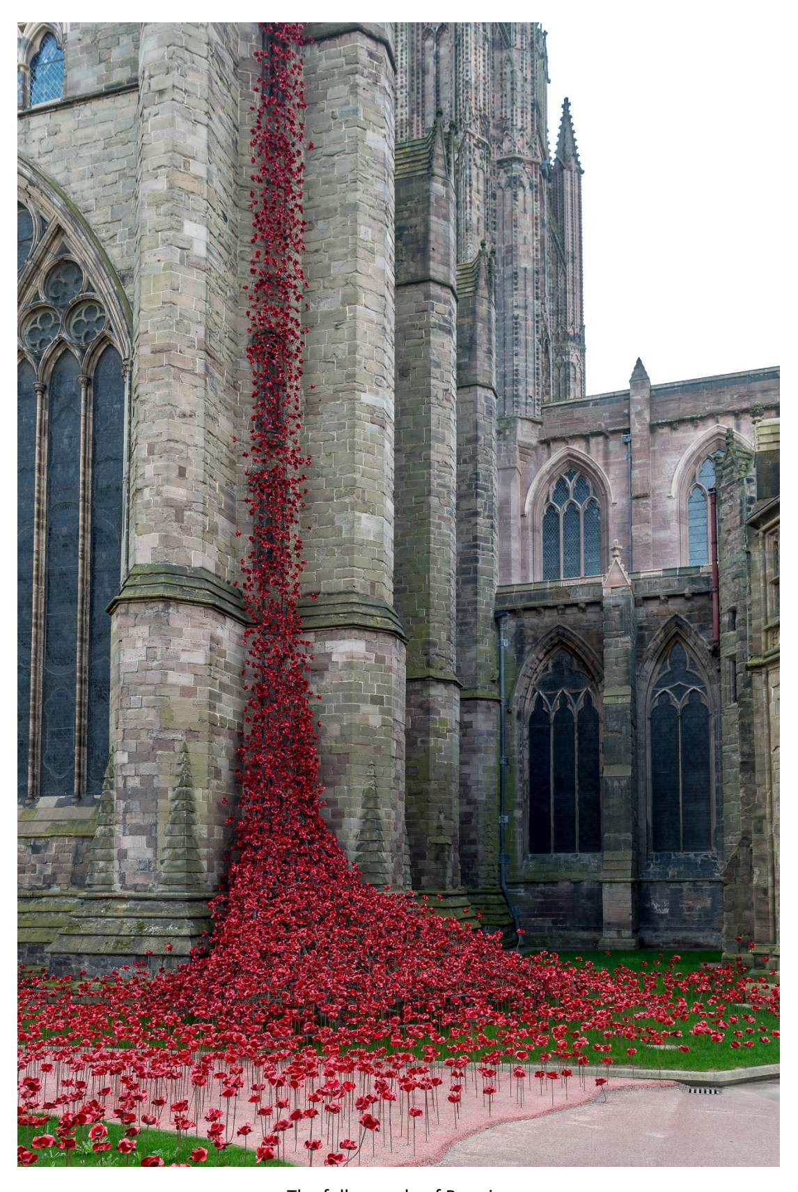
The full cascade of Poppies