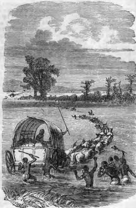
CROSSING A RIVER IN ZULULAND.

good Christians, who cannot stand up against the smallest opposition for their right to obey God's commandments, and others who will not give up the slight gratification of their daily glass of beer, even for the sake of their tempted husbands. Let them take care, lest in that day when many shall come from the east and the west, and sit down with all the saints in the kingdom of Heaven, that poor, black woman does not rise up against them as a witness!